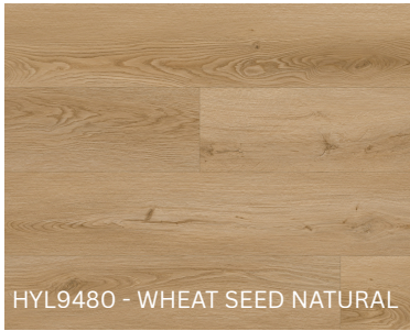
HYL9480 - WHEAT SEED NATURAL