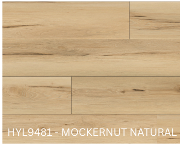
HYL9481 - MOCKERNUT NATURAL