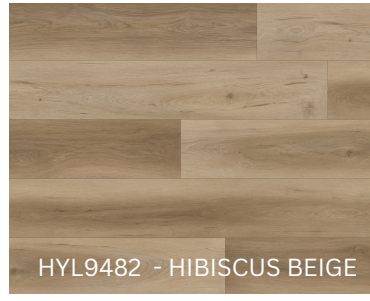
HYL9482 - HIBISCUS BEIGE