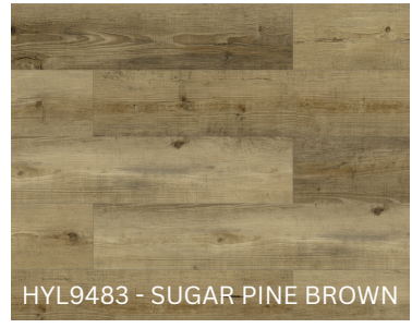
HYL9483 - SUGAR-PINE BROWN