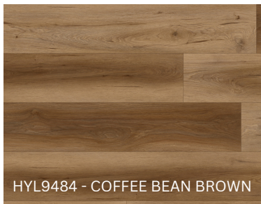
HYL9484 - COFFEE BEAN BROWN