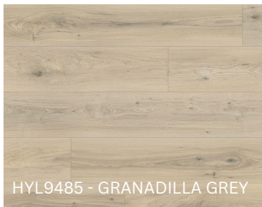
HYL9485 - GRANADILLA GREY