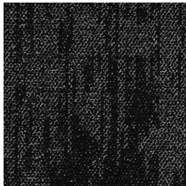
TWE5011 - Charcoal Weave