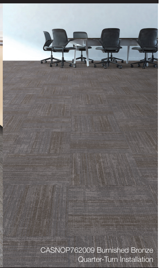
CASNOP762009 Burnished Bronze Quarter-Turn Installation