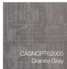
CASNOP762005 Granite Gray