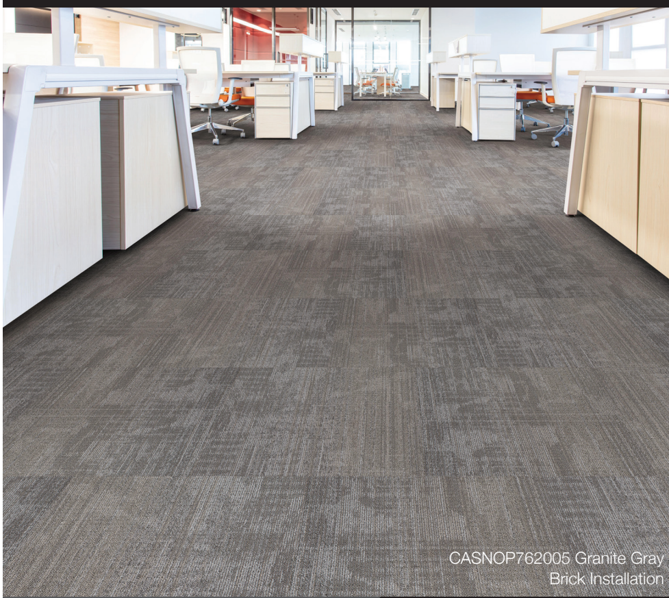
CASNOP762005 Granite Gray Brick Installation