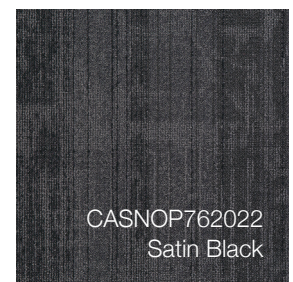
CASNOP762022 Satin Black