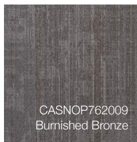
CASNOP762009 Burnished Bronze