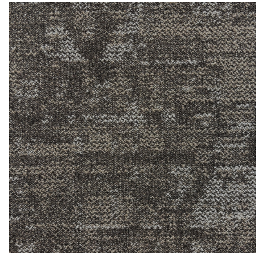
MIR5012 - Desert Palms